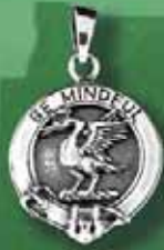
Campbell of Cawdor